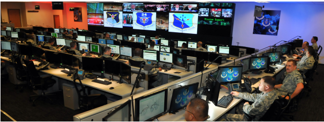
Fig. 1. A Security Operations Centre (SOC) [35]

The objective of a SOC is primarily to mitigate cyber-security threats towards the organisations for which they are responsible [42]. Internal SOCs are responsible for the organisations they are placed within, while multitenanted SOCs monitor network security on behalf of multiple client organisations. Figure II-A is an example of a SOC, with security data presented to security practitioners on computer monitors. Practitioners are frequently required to work long shifts, including night shifts, looking at multiple screens for extended time periods [40]. The resulting pressure and demanding nature of SOC work have been highlighted in HCI research [39], [40].